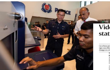
Defence lawyers will be able to view a video-recorded statement only at an approved place, such as a police station. The unauthorised copying, use or distribution of the video will also be an offence. In 2015, the Ministry of Home Affairs announced the availability of video-recorded interviews with suspects in a pilot programme. But this did not take place, as the appropriate legislative framework was not yet in place.

> New Police Division will better serve... See More